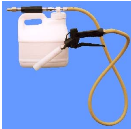
Figure 4 - Bottle dispensers and foamers