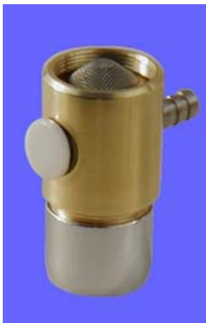
Figure 3 - Faucet mounted proportioners

Below are some examples of non-1055 systems: