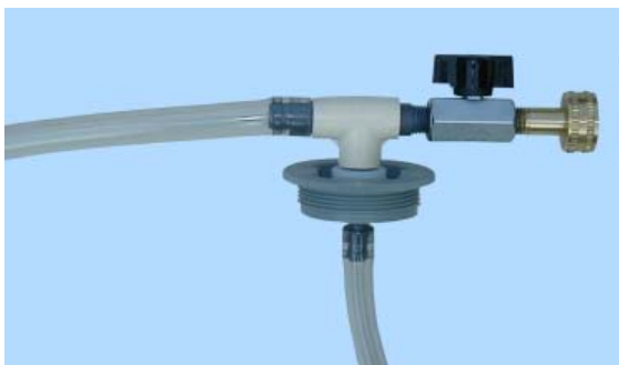
Figure 6 - Drum-mounted proportioners