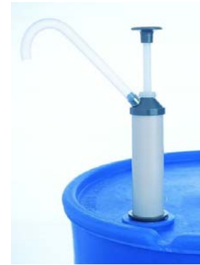
Figure 5 - Hand pumps