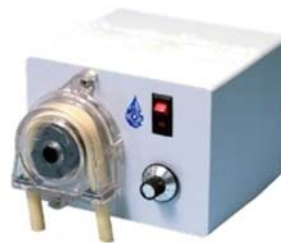
Figure 7 - Peristaltic pumps