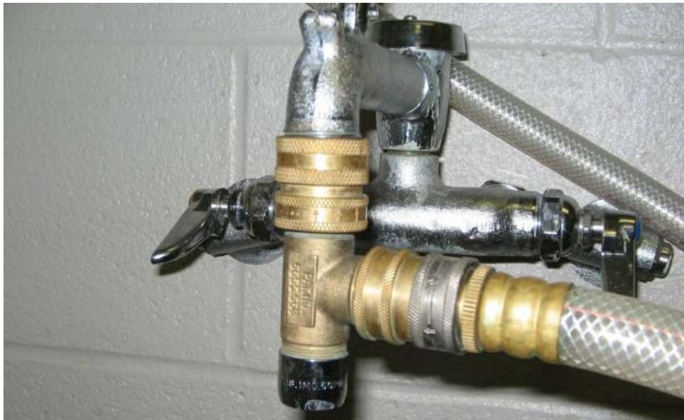
Figure 2 - Example pressure bleed device.

When a hose connection is permanent and there is an ASSE 1001 or 1011 upstream of it, there must be a pressure bleed device (PBD) installed. Water will flow out of the PBD as long as the faucet is turned on. Having the water on for more than 12 hours is still considered a permanent connection, so when the device is not in use, the faucet needs to be turned off. A visual indicator of running water should be enough to prompt a user to turn it off.